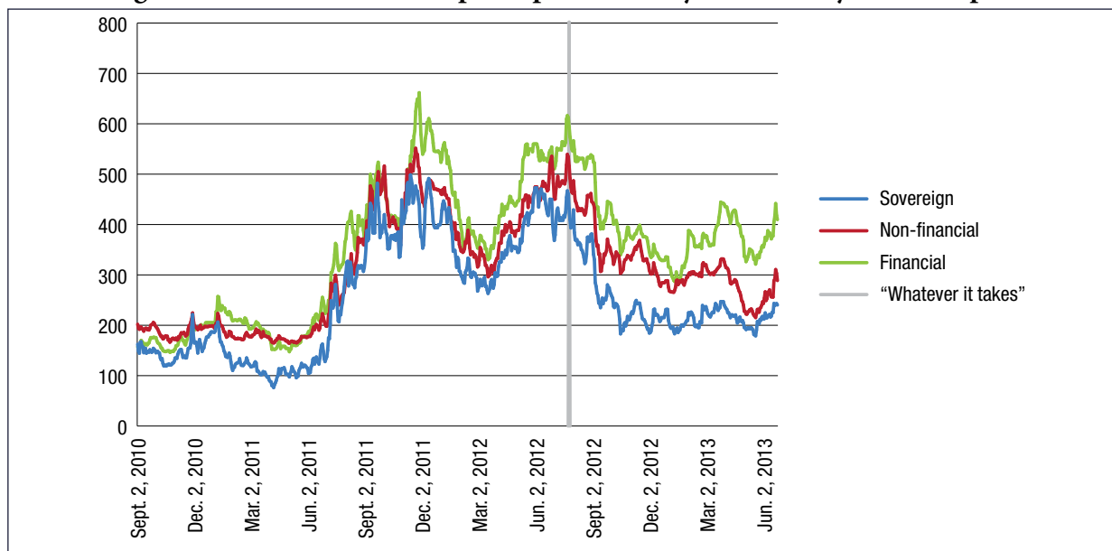
Figure 2b: Credit default swap risk premia on 5 year bonds by sector – Spain

Note: The non-financial and financial series refer to the unweighted average of bonds by the five largest financial and non-financial corporations in the country.