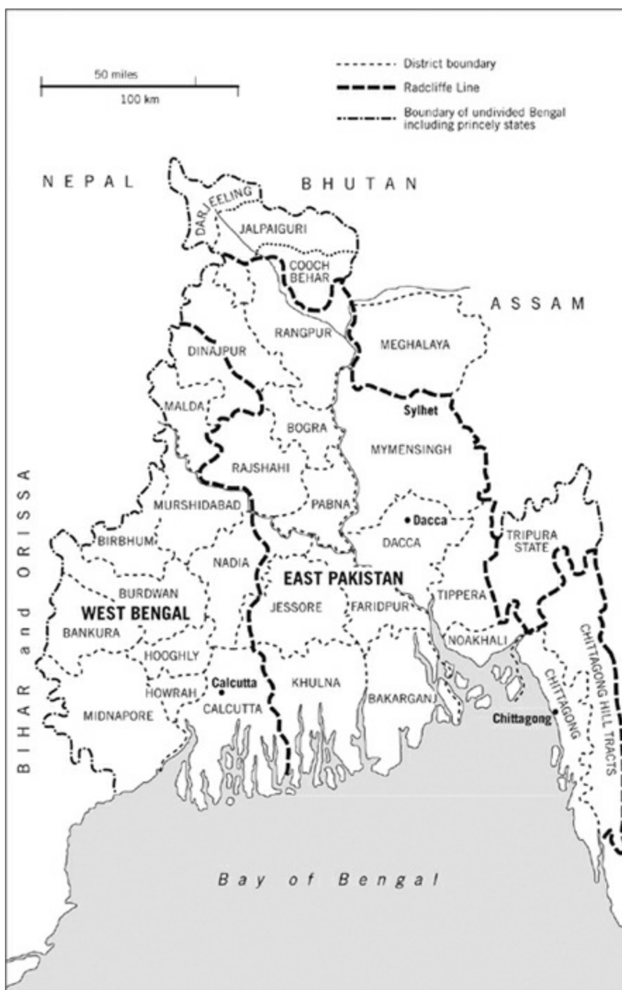
4 The Radcliffe Line in Bengal