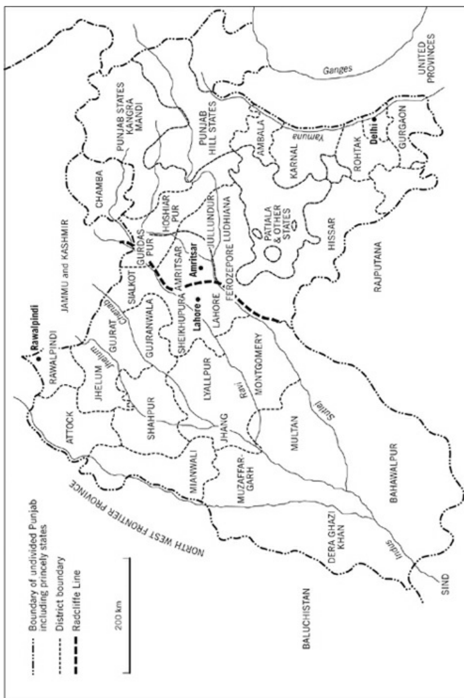
3 The Radcliffe Line in Punjab