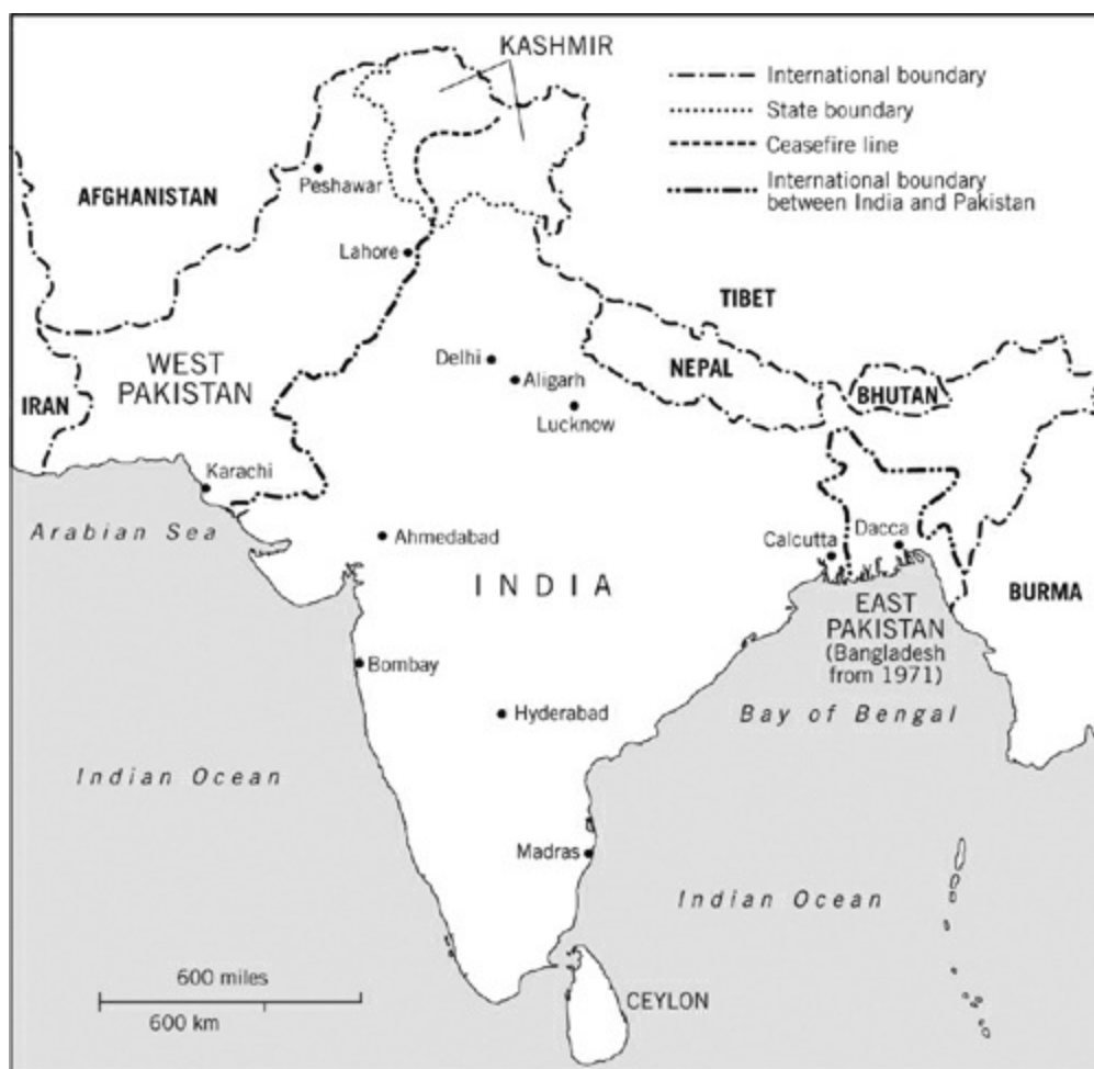
2 India and Pakistan after Partition