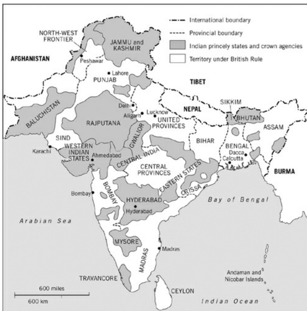
1 India before Partition